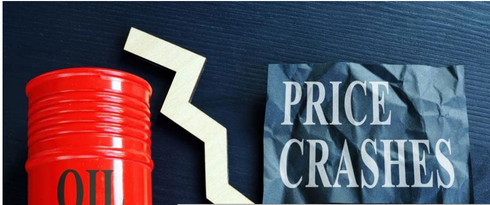
New York crude oil futures