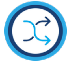
Cutover & Migration

There are no changes to the content or structure of existing functional or messaging specifications with this portal restructure. Previously published pages that duplicate content from the Industry Test Strategy will be archived.